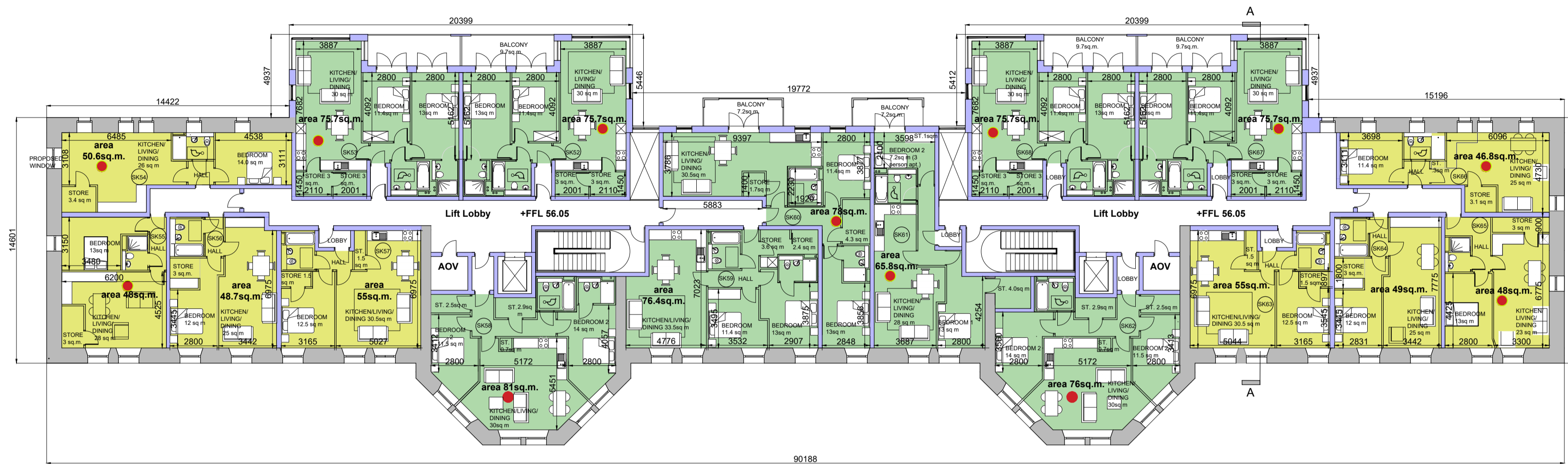
1 L03-Third Floor Plan - St. Kevin's Apartments 1:200 NO CHANGE